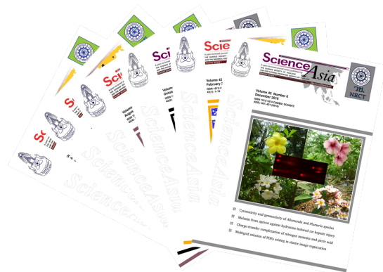
Fig. 2 Cover pages of different issues of ScienceAsia .

not the only issue, but is among the first requirements to be considered for a journal or publisher. For ScienceAsia , the journal has a dedicated website www.scienceasia.org with the necessary software developed in-house which can handle unlimited number of submitted manuscripts and communicate efficiently with authors and reviewers. Clearly, the number of submitted manuscripts cannot be counted as the success of the journal. Analysis of these manuscripts revealed that there remain numerous manuscripts which are out of the scope of the journal and some are unsuitable for publication in ScienceAsia .